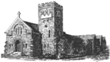
Celebrating God's goodness