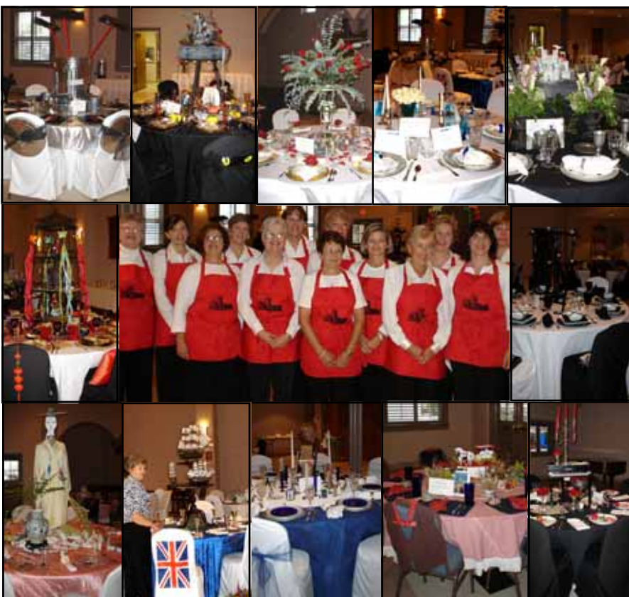
CALENDAR PARTY 2007

Thanks to each and everyone of you for your participation. We're gonna have one "heck" of a note-burning celebration when this campaign zeroes out the loan balance! Everyone will be invited just as everyone is invited to be a part of the historic accomplishment! It may be a bit early to shop for party clothes, but it's getting closer and closer. It just keeps on keeping on.